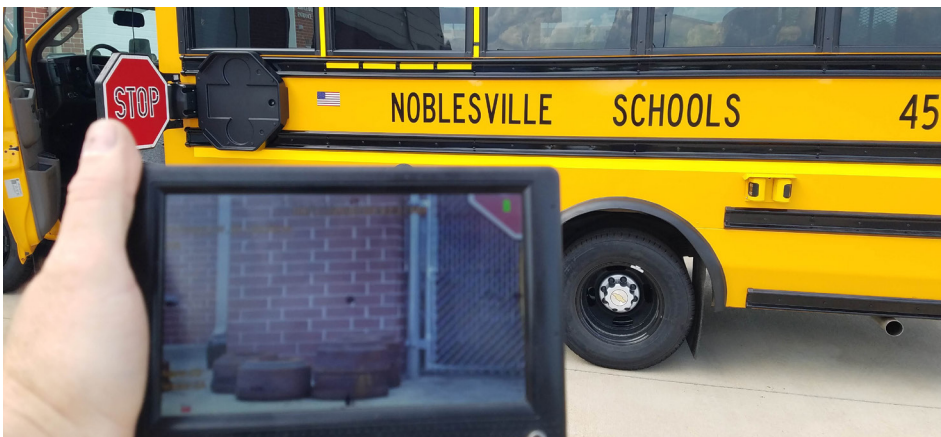
Noblesville School Bus, Stop Arm installation

An important feature for any stop arm camera system is that it needs to be simple to use. The Student Protector Stop Arm Camera System can be easily mounted to the side of a bus. SP25 comes with two license plate reading cameras and up to 3 overview cameras for a total of up to 5 cameras. The system captures all the data of an infraction and seamlessly allows for a complete evidence package to be created complete with license plate imagery, GPS coordinates, vehicle speed, if warning lights were active, was stop arm deployed, date, time and driver identification. All that data is automatically included in each video and is easily extracted with Gatekeeper's G4 Incident Management Software.