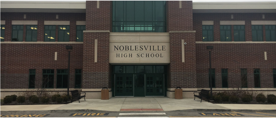
Noblesville High School, Indiana