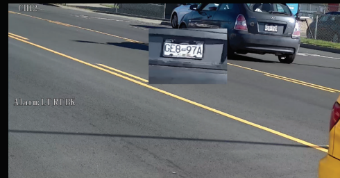
Vehicle from lane 4 with visible back tag captured during the day

OPERATING TEMPERATURE -40°F to +158°F (-40°C to +70°C)