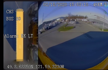
Left Turn Camera View