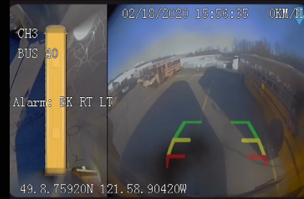
Reverse Camera View