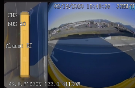
Right Turn Camera View