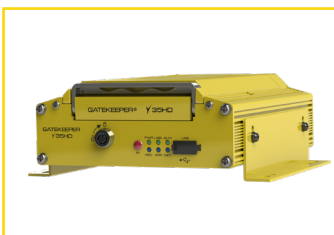
Y35 HD DVR