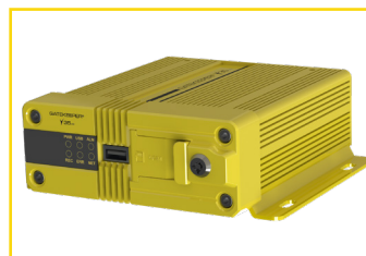
Y35 V2 DVR