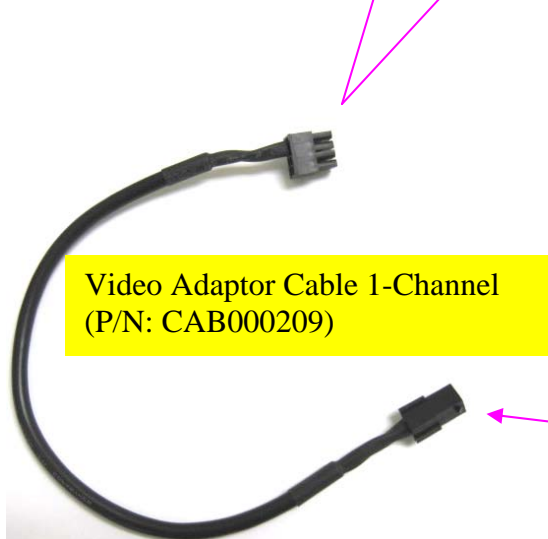
Video Adaptor Cable 1-Channel (P/N: CAB000209)