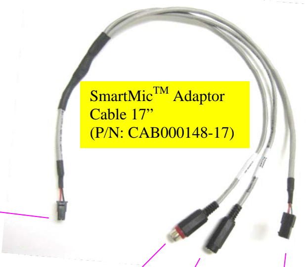
SmartMic™ Adaptor Cable 17'' (P/N: CAB000148-17)