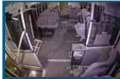
Interior: Front to Rear