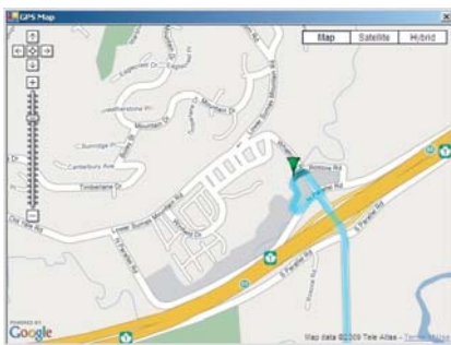
Integrated Map Records Bus Route

Synchronized four channel video playback allows you to monitor activity from every camera simultaneously while keeping main camera blown up to full resolution. Point and click on individual images automatically switches it to full resolution.