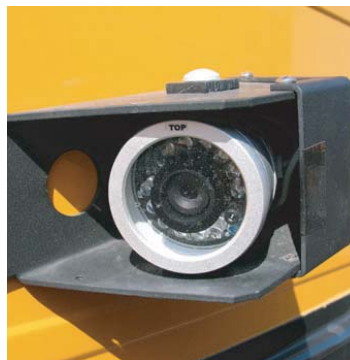
Mounted Stop Arm Camera With Night Vision