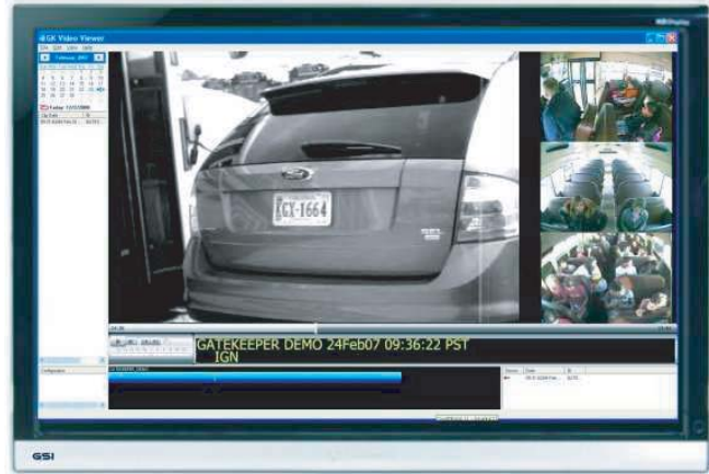
Actual Image Captured Using A Gatekeeper Systems Stop Arm Camera